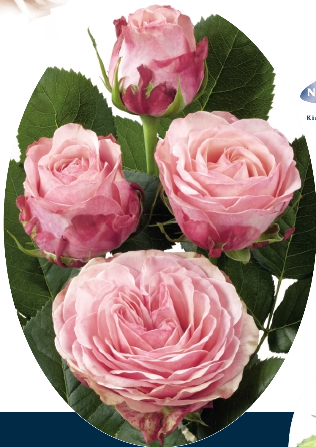
New! King Arthur®