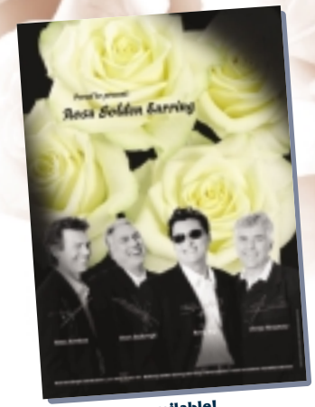
Poster available! (Created in cooperation with Golden Earring)